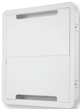
Flush, Wi-Fi transparent, removable cover with venting and cable access. 17" models include split cover that supports removal even when partially covered