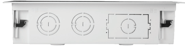
Top power receptacle and cable management knockouts