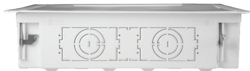
Bottom power receptacle and cable management knockouts