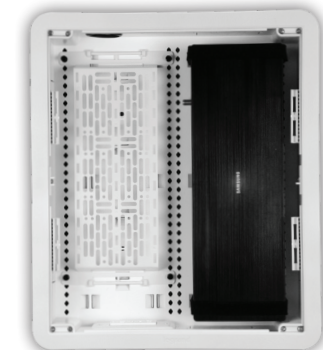
17" models are compatible with Samsung One Connect Box