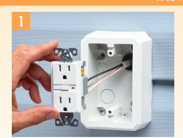
Remove KO from FS Box & insert NM cable connector. Push cable through connector & position box onto siding.