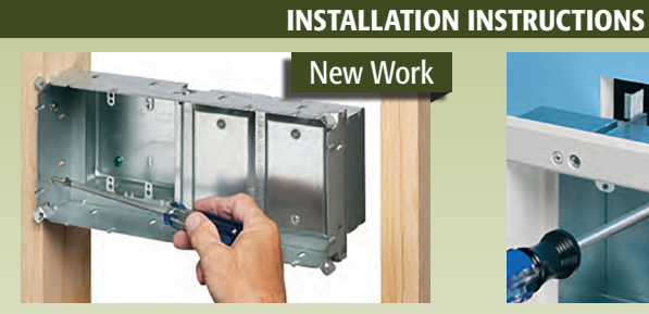
Attach box to stud using #6 screws. Pull wires.