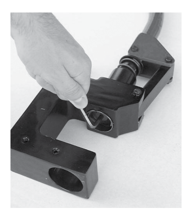
1) To remove punch from SP-7 unscrew hex bolt at center of punch using a #5 hex wrench.

SP-7 Stud Punch includes two different size punches: 7/8" (22.5mm), 1 11/32" (34.1mm)