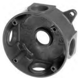
4" round surface mount box 4" diameter x 1-1/2" (102mm x 38mm) Requires SLD4RAD adapter

*This is a representative list of compatible junction boxes only. Information contained in this literature about other manufacturers' products is from published information made available by the manufacturer and is deemed to be reliable, but has not been verified. Cooper Lighting Solutions makes no specific recommendation on product selection and there are no warranties of performance or compatibility implied. Installer must determine that site conditions are suitable to allow proper installation of the mounting bracket in the box.