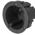
3-1/2" round old work non-metallic box 4-1/4" O.D. flange, 3-1/2" I.D. x 2-5/8" (108mm O.D., 89mm I.D. x 67mm)