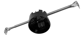
4" round new work non-metallic box with hanger bar assembly 4" diameter x 2-3/16" (102mm x 56mm)