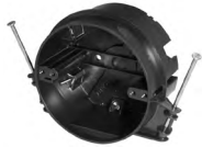
4" round new work non-metallic light fixture/fan box 4" diameter x 2-3/16" (102mm x 56mm)