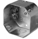
4" octagon light fixture/fan steel box 4" x 4" x 2-1/8" (102mm x 102mm x 54mm)