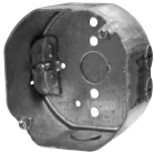
TP316 for non-metallic cable 4" x 4" x 2-1/8" (102mm x 102mm x 54mm)