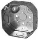
4" octagon steel box 4" x 4" x 1-1/2" (102mm x 102mm x 38mm)