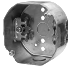
TP317 for metal clad cable 4" x 4" x 2-1/8" (102mm x 102mm x 54mm)