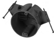
3-1/2" round new work non-metallic ceiling box 3-1/2" diameter x 2-3/4" (89mm x 70mm)