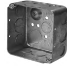
4" square deep steel box 4" x 4" x 2-1/8" (102mm x 102mm x 54mm)