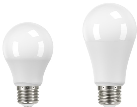
8.5W A19 E26 base