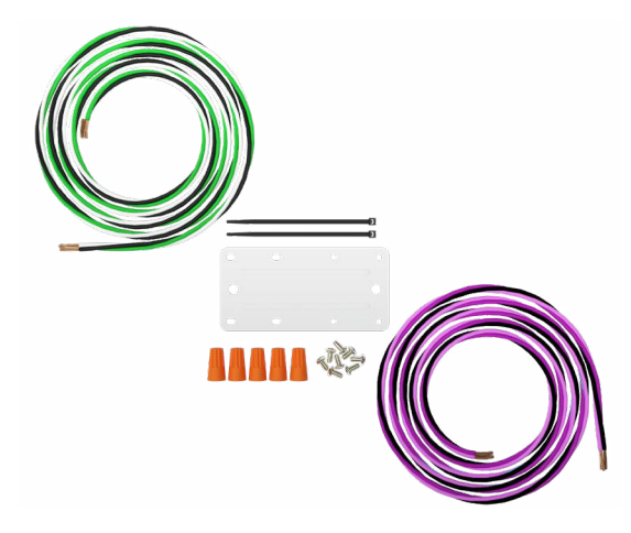
Daisy Chain Mount Kit: SR JOIN KIT

Continuous-run mounting is a breeze with the joiner bracket accessory.