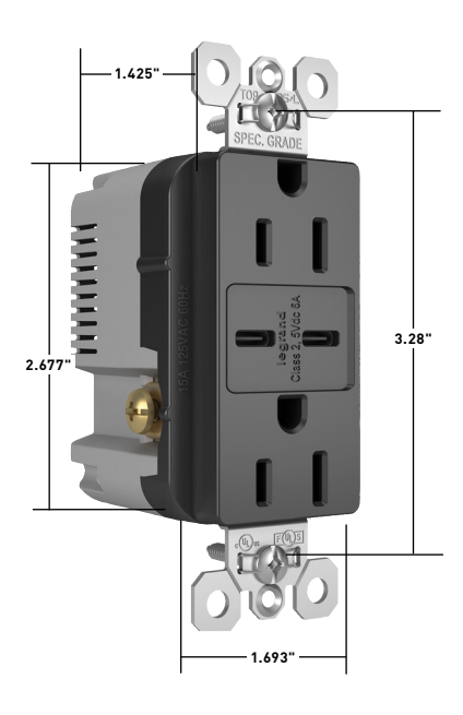
Dimensional information is the same for all models.