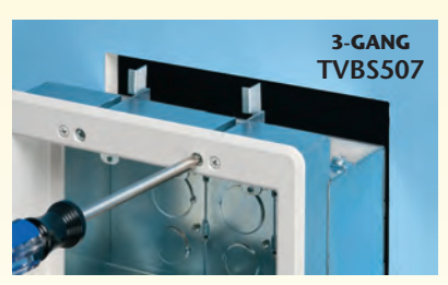
In old work mounting wings secure box in wall