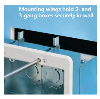
1 Cut hole. Use enclosure (without trim plate) as a template.