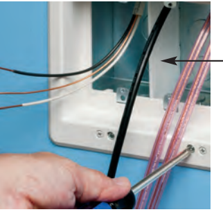
2 Pull cable. Insert box in hole. Tighten mounting wing screws to hold box securely against wall.