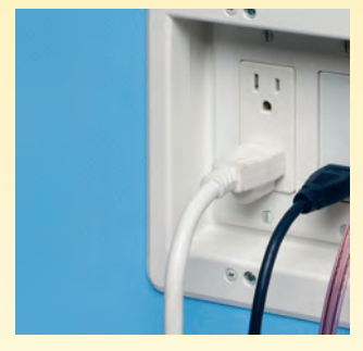
3 Install devices, then the wall plates.