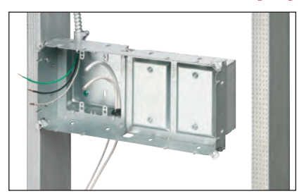
1 Attach box to stud. Pull wire.