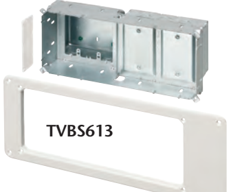
View Video Steel TV Box