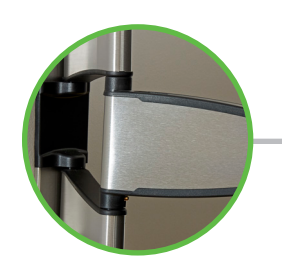
Stylish brushed metal exterior seamlessly blends with TV and décor