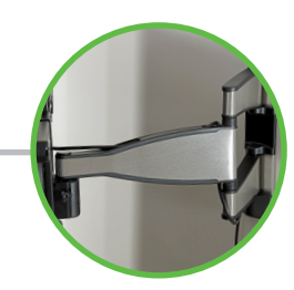
In-arm cable management creates a clean look