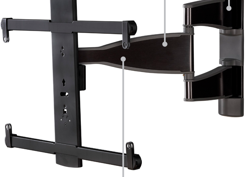
Precision-engineered, ultra-strong, solid steel frame provides maximum support