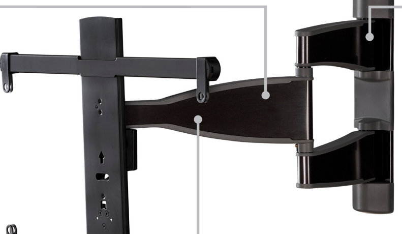
unwanted TV movement