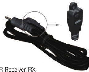
IR Receiver RX