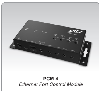
PCM-4 Ethernet Port Control Module