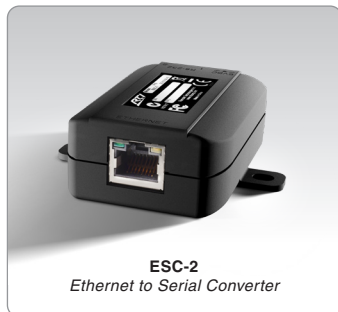
ESC-2 Ethernet to Serial Converter