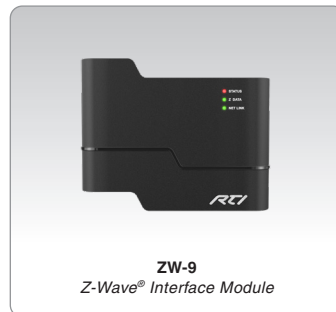
ZW-9 Z-Wave® Interface Module