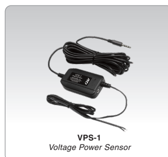
VPS-1 Voltage Power Sensor