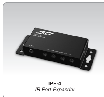
IPE-4 IR Port Expander